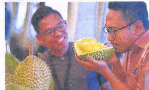
A strong aroma (without any sour-ish odour) is one of the underlying qualities of a good durian.

"And the more discerning the public gets about fruit quality, the more farmers will monitor their fruit and ultimately raise the bar for quality durians in the market space," he says.