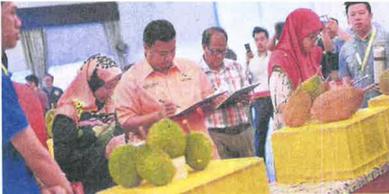
Because durian farming has become such a lucrative industry to be in, durian farmers are increasingly receptive to entering competitions as this gives them an idea of how their fruits fare against those of their competitors.