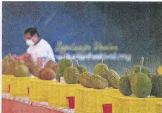
This year's competition saw more than 50 entries vying for the top spot in different categories.