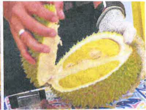
Durians start ripening once they drop from trees, but the ripening level depends on factors like the weather and nutrient distribution at the farm level.