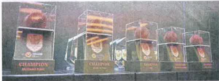
The winners of durian competitions like Bangi Golf Resort's World Durian Championship: Malaysia Edition often end up getting more recognition after their win.