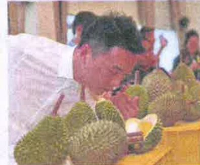
Durian experts are not afraid to get up close and personal with the fruit.

three hours if you give them a fruit to eat, they will like it.